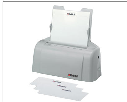
Small compact design allows for easy placement on any desk or surface. (model 10540)