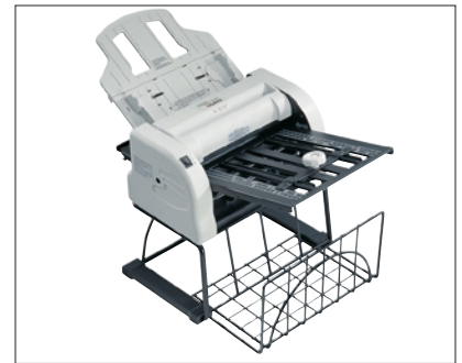
Paper tray allows for continuous folding of up to 50 sheets of paper.