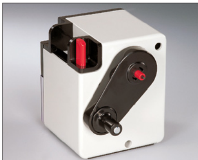
Mounting is not necessary which allows for easy placement and portability.