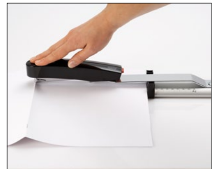
Adjustable depth guide ensures you staple at the desired depth each and every time