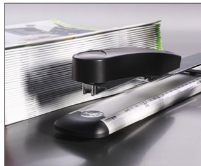
An 11 3/4" throat depth for greater reach across documents, is perfect for binding booklets.