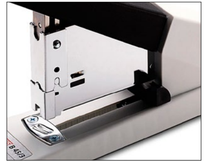
Adjustable depth guide ensures you staple at the desired depth each and every time.