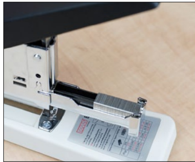
Dual staple guide system provides even pressure on the staple legs until it clinches your documents.