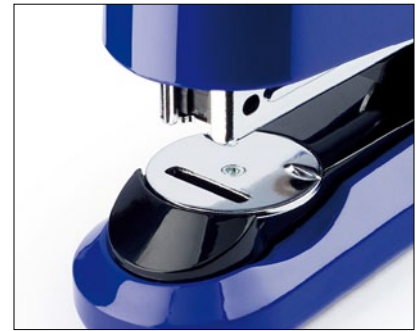
Adjustable anvil rotates for either a permanent flat clinch, temporary pin, or tack.