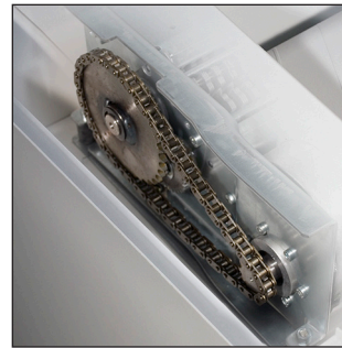
Chain-driven cutting mechanism provides slip free power for maximum throughput.