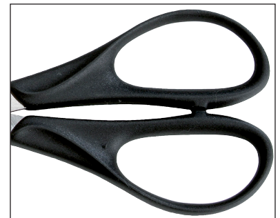
Form fitting handles provide comfort and reduce fatigue during continuous use.