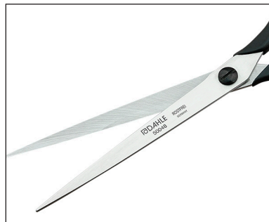
Screw fastened blades, machine ground, & hand finished for a superior cut.