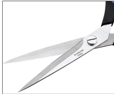
Double ground blades are screw fastened & able to cut through thicker materials.