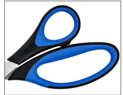
Soft cushioning is gentle on the hands & reduces fatigue when continually cutting.