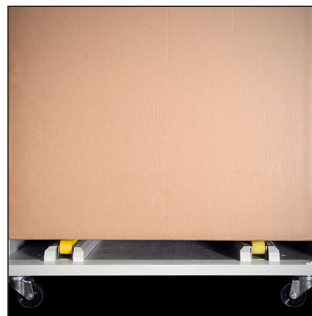
Conveyor of rollers on each side allows for easy removal of the 50 gallon waste container.