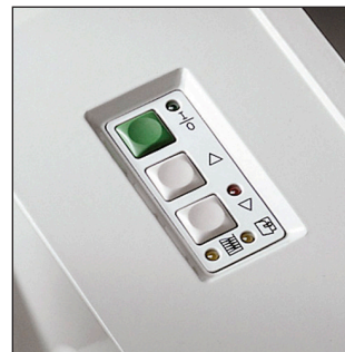
The electronic control panel allows for auto on/off, continuous run, and reverse operation.