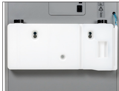
The 1 gallon EvenFlow Lubricator provides continuous lubrication for peak performance.

-Quality build with trouble free operation