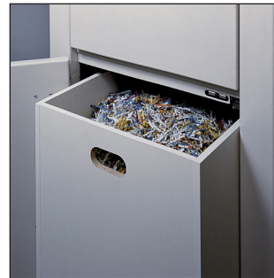
Rolling castors beneath a wooden waste bin allows for easy removal of the 50 gallon waste container.