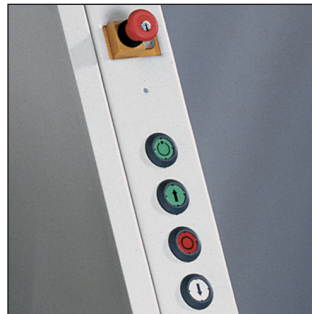
For safety, these machines feature a special locking mechanism to prevent injury and unauthorized use.