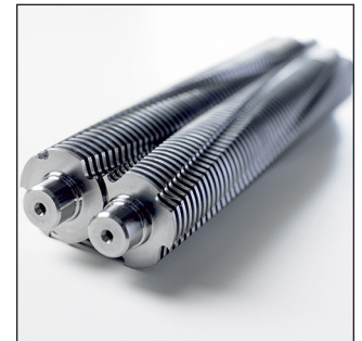
In order to provide slip free power to the cutting cylinders, a steel chain & gears connect the two for maximum capacity.