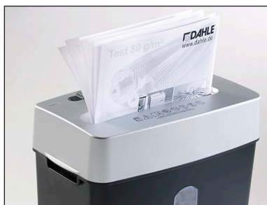
Built-in jam protection - Slide the switch to reverse motor if sheet capacity is exceeded.

Shreds credit cards, paper clips, & staples