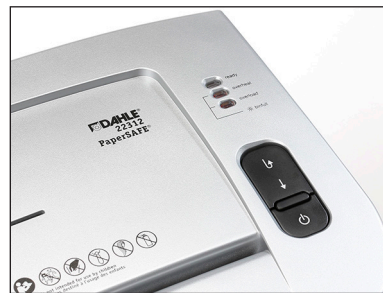
Easy to Operate - LED indicators and push button controls allow for easy operation.