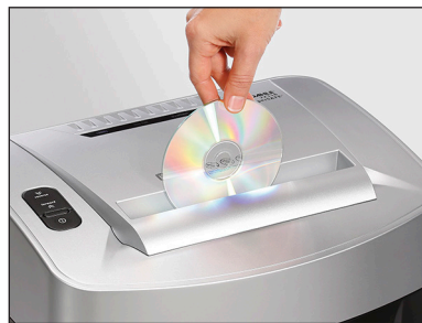
Multi+Media- This machine easily shreds CDs' credit cards, paper clips and staples.