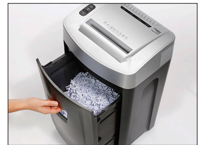
Easy to empty waste bin- Pull open front to empty shredded waste container.