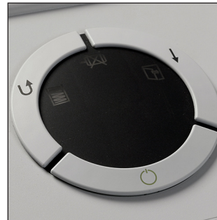
The easy-to-use command dial controls all of the shredder's functions such as power up, reverse, and continuous run.