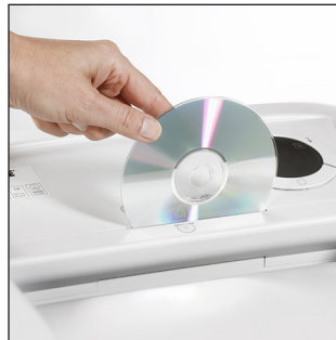
Dahle Professional shredder with built in user-friendly opening for CD/DVD destruction.