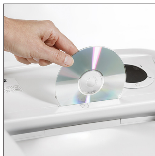
Dahle Professional shredder with built in user-friendly opening for CD/DVD destruction.