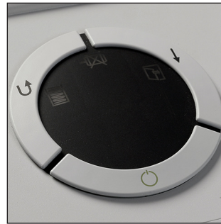
The easy-to-use command dial controls all of the shredder's functions such as power up, reverse, and continuous run.