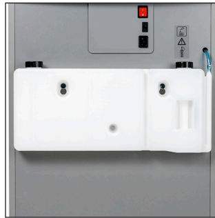
Built in EvenFlow Lubrication System evenly lubricates the cutting cylinders reducing the risk of a paper jam.