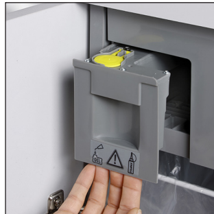
Built in EvenFlow Lubrication System evenly lubricates the cutting cylinders reducing the risk of a paper jam.