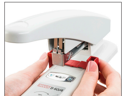
Adjustable depth guide allows you to set the staple location for consistent accuracy.