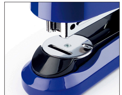
Adjustable anvil rotates for either a permanent flat clinch, temporary pin, or tack.