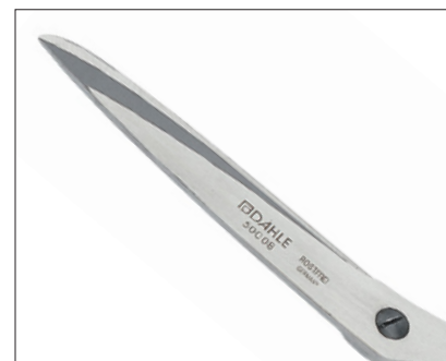
Double ground blades offer precision trimming of thicker material