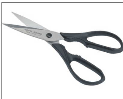
Item 50038 features an aggressive micro-toothed cutting edge that will cut through some of the toughest material.