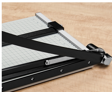
The automatic paper clamp holds work securely and prevents paper shifting.