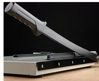
Spring action blade returns to the up position after trimming to reduce fatigue.