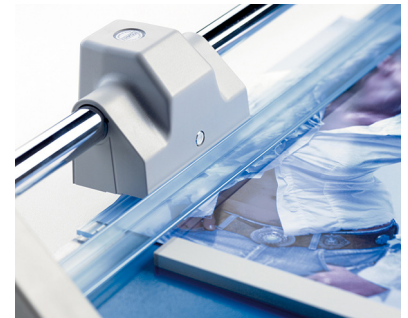
Automatic clamp holds work securely and prevents shifting while trimming.