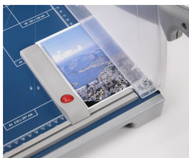
This Dahle trimmer features a manual clamp with built-in finger protection.