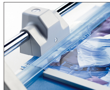
Automatic clamp holds work securely and prevents shifting while trimming.