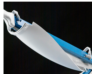
Revolutionary safety guard rotates around the blade throughout the entire cutting process.