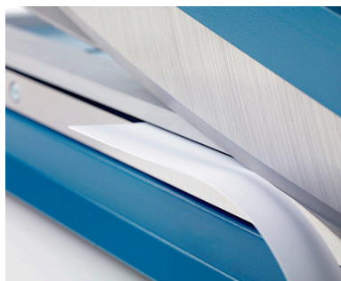
This self sharpening blade offers extreme precision and accuracy while cutting.