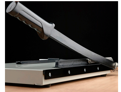
Spring action blade returns to the up position after trimming to reduce fatigue.