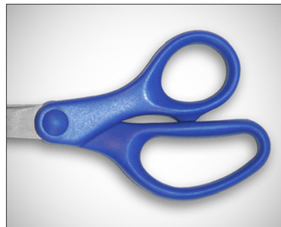
Contoured handles fit comfortably around your fingers and reduce fatigue.