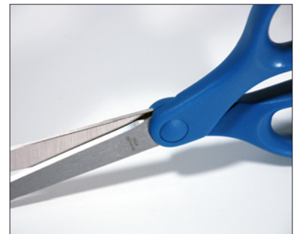
Stainless steel blades resist rust and maintain a sharp cutting edge.