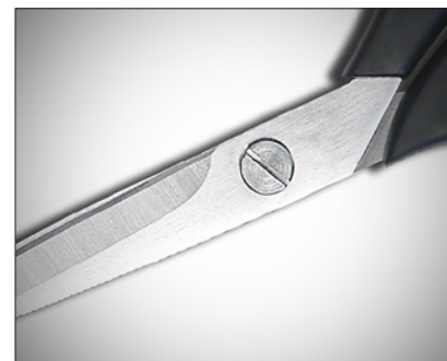
Blades are screw fastened and feature a double ground surface to cut through thicker materials.