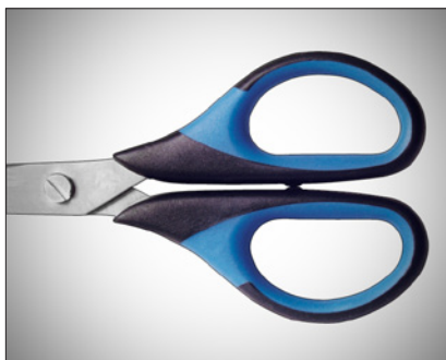
Soft cushioning is gentle on the hands and reduces fatigue when continually cutting.