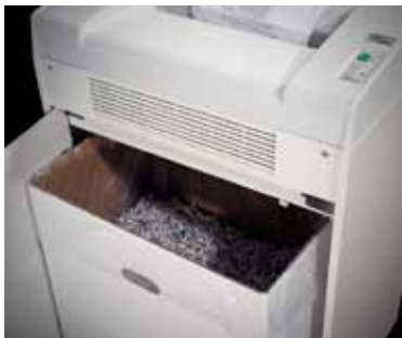
Large 35 Gallon waste compartment requires less frequent bag changes.

Known for their power and waste capacity, Dahle Department Shredders provide a practical solution for accommodating the shredding needs of even the busiest offices. These machines can continually shred large quantities of paper for long periods of time and are designed to shred between 2,000 and 12,000 sheets of paper per day. Their attractive design and large storage bin make them a nice addition to any large office, copy room or communications center.