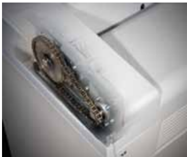
Chain-driven motor provides slip free power to the cutting mechanism.