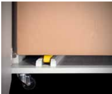
Conveyor of rollers on each side make easy removal of the 50 gallon waste container.