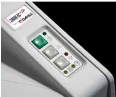
The electronic control panel allows for auto on/off, continuous run, and reverse operation