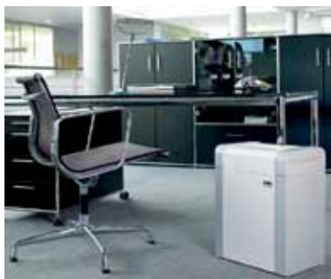
Desk side placement makes it easy to shred without leaving your workstation.

It's all about convenience with a Dahle Personal Shredder. Whether you're an executive, a secretary, or someone looking for added security at home, these machines are small enough to accommodate any workspace yet powerful enough to get the job done. Dahle's smallest line of shredders are designed for shredding up to 100 sheets of paper per day and are perfect for destroying bank statements, credit applications and financial records. These shredders can be conveniently placed at arms length so you never have to leave your desk to properly dispose of confidential documents.