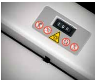
State-of-the-art electronics conveniently turns the shredder on when shredding and then off.