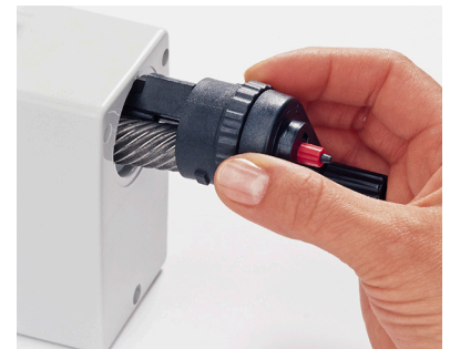
The sharpening blade can easily be removed and cleaned when using colored wax pencils.