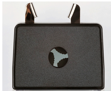
Coated barrel grips hold the pencil securely as pencil is pulled in and sharpened.