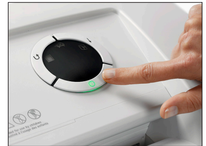
The command dial controls power up, reverse, and continuous run functions.