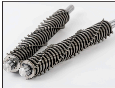
Aggressive cutting edges provide grip, and superior shredding performance.