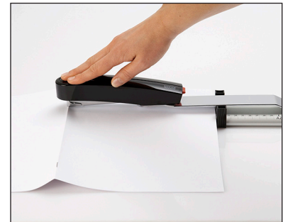
Adjustable depth guide ensures you staple at the desired depth each and every time.