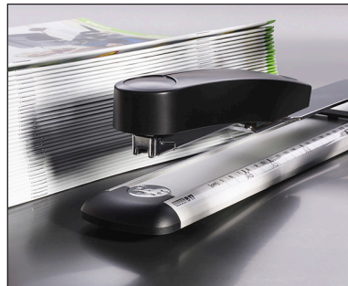
An 11 3/4" throat depth for great reach across documents, is perfect for binding booklets.