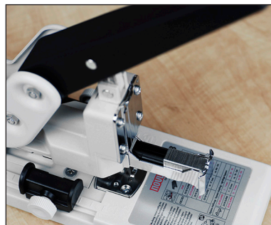
Dual staple guide system provides even pressure on the staple legs to prevent jams.