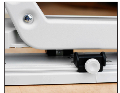
Adjustable depth guide ensures you staple at the desired depth each and every time.