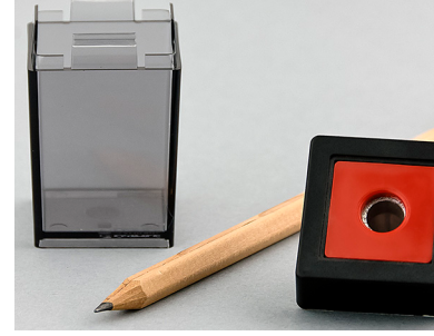
A high impact plastic shell protects if dropped, and keeps pencil shavings from spilling.