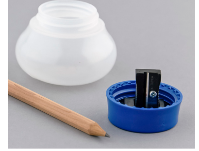
Wedge and canister sharpeners feature screw fastened blades for easy replacement.